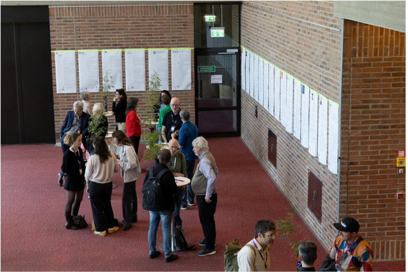
GRANSHAN Exhibition at DIVE'25, Munich 2025