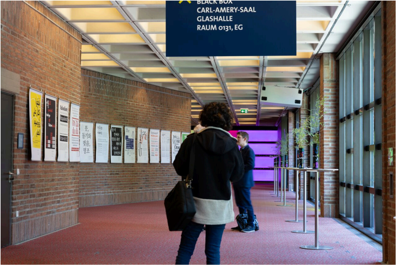
GRANSHAN Exhibition at DIVE'25, Munich 2025