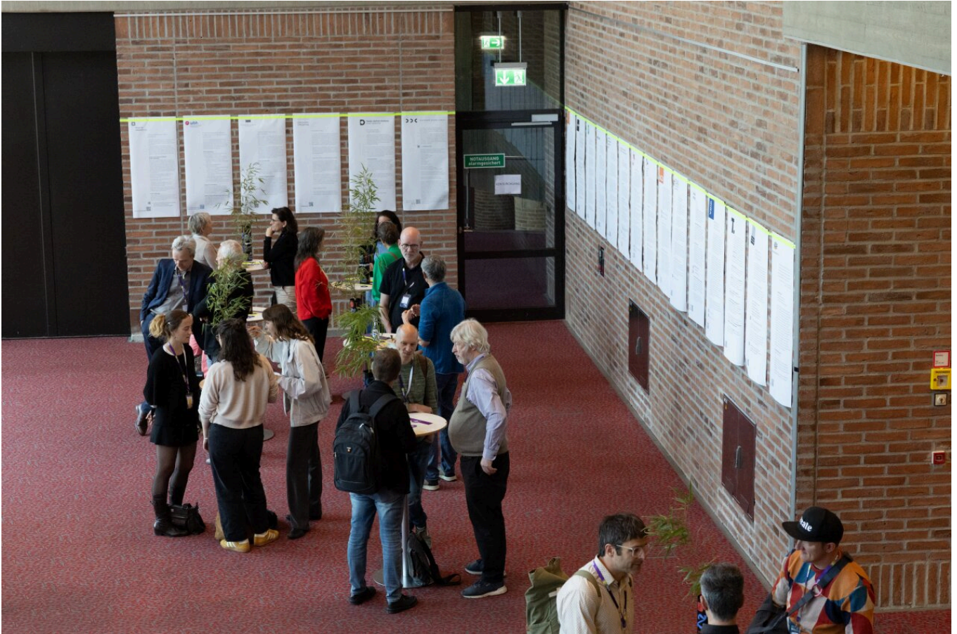
GRANSHAN Exhibition at DIVE'25, Munich

applications - all culminating in design as a force to shape sustainable and inclusive futures. The conference was able to bring the power of design to life, inviting stakeholders to engage with pressing societal questions through a design lens.