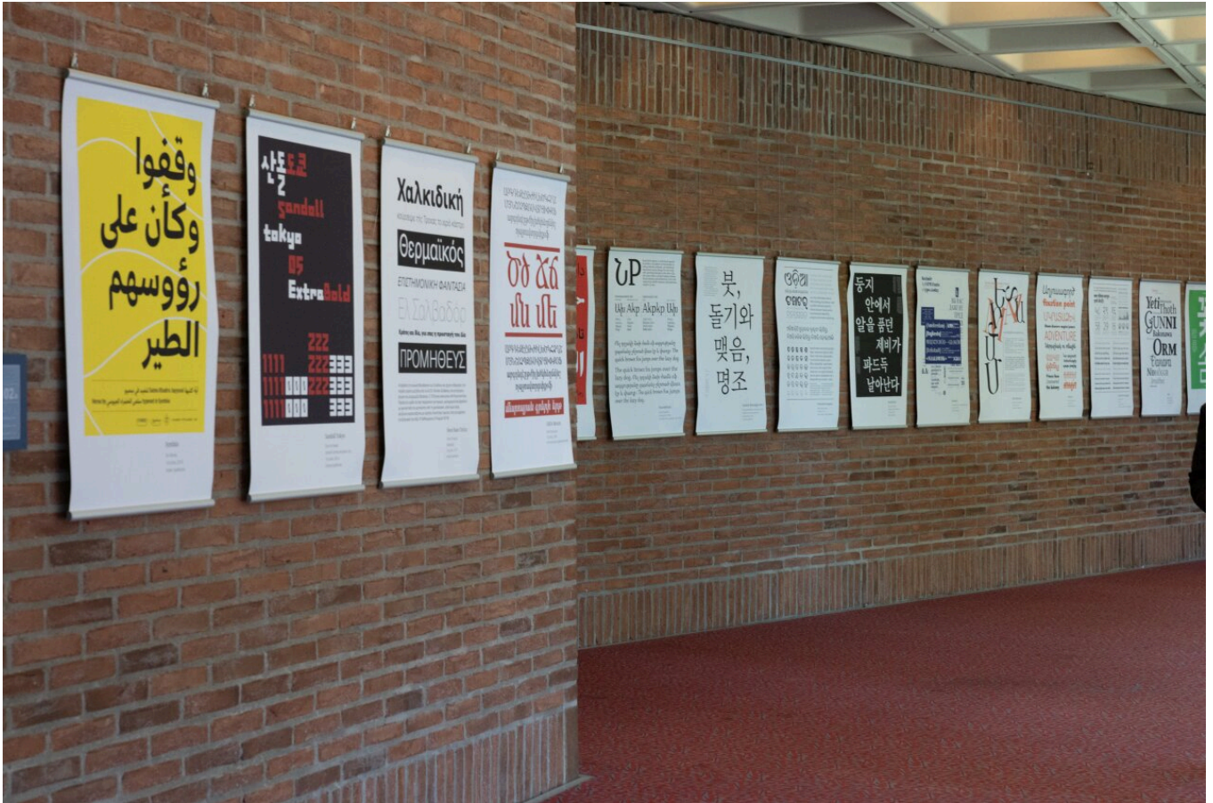
GRANSHAN Exhibition at DIVE'25, Munich

Originally published at https://granshan.com/insights/granshan-x-dive25-a-partnership-for-transformative-design-and-script-diversity . © 2026 GRANSHAN.