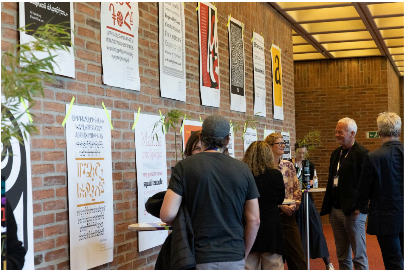
GRANSHAN Exhibition at DIVE'25, Munich

The series was GRANSHAN's follow-up to its initiative to advance intercultural awareness through typography and to foreground the rich diversity of the world's writing systems. It also most fittingly contributed to DIVE'25's initiative to showcase how design, in all its forms, can impact and spur social change.