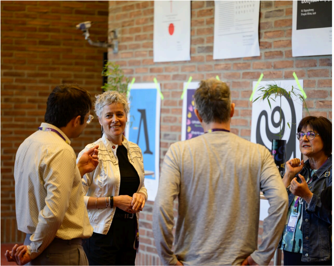
GRANSHAN Exhibition at DIVE'25, Munich.