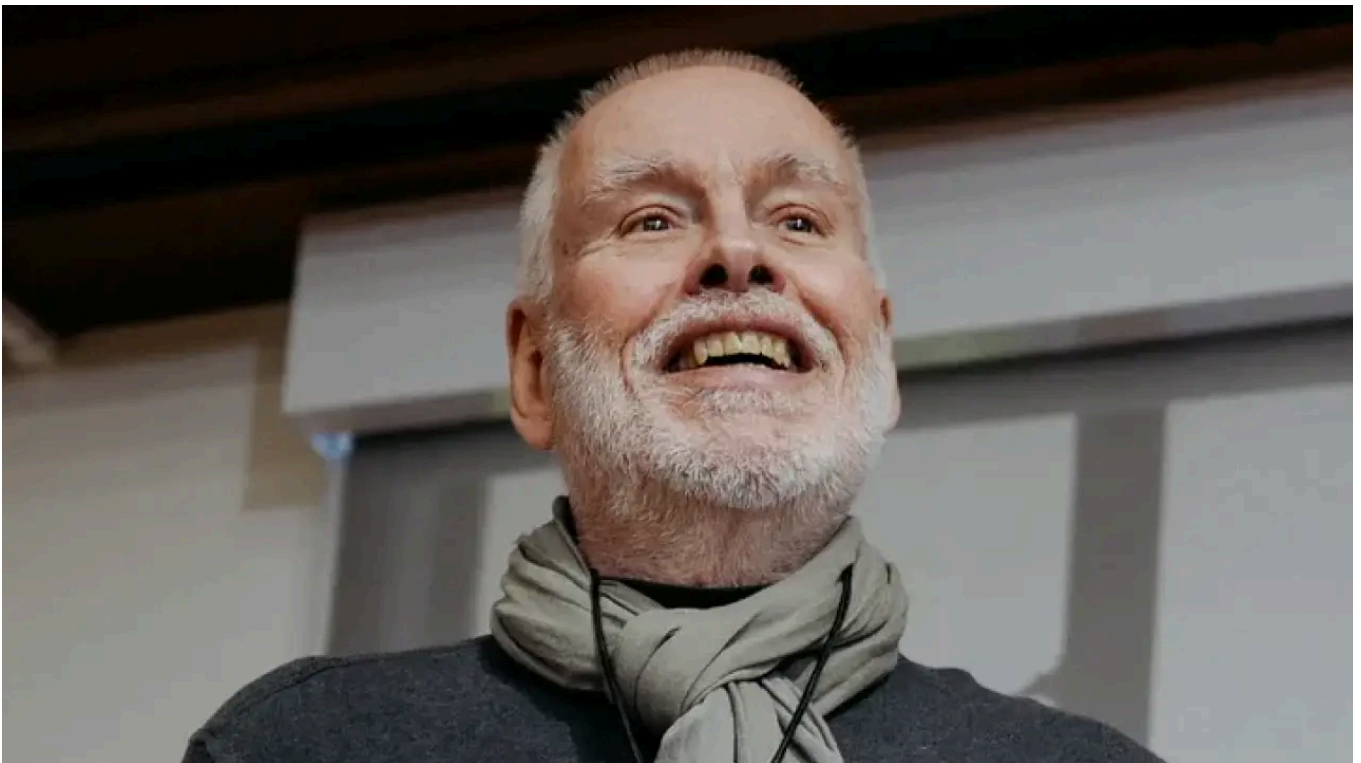
[, at the Face/Interface conference at Stanford University, January 2025]

At GRANSHAN, we are dedicated to fostering the appreciation and advancement of typography across languages and cultures. A key part of that mission is recognizing and preserving the historical milestones that have shaped our field. One such milestone is the history of ATypI (Association Typographique Internationale), an organization that has played a fundamental role in global typography for over 70 years. By supporting this documentation project, we contribute to safeguarding the knowledge that has influenced type design, ensuring it remains accessible for future generations.